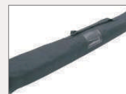
Heavy-duty Nylon Carry Case