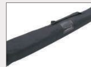
Heavy-duty Nylon Carry Case