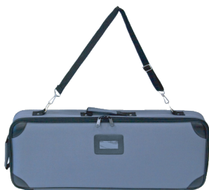
Travel bag is included