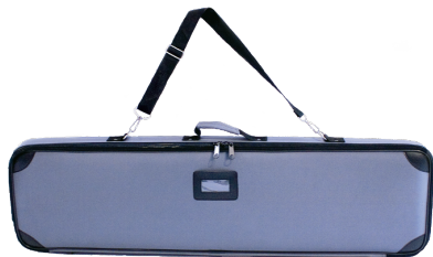
Travel bag is included